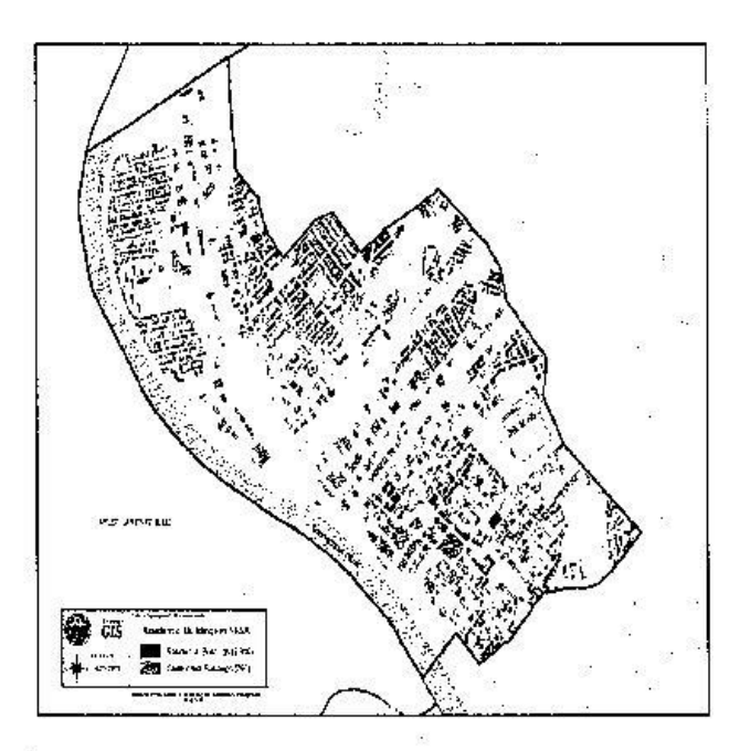
NEIGHBORHOOD REVITATIZATION STRATEGY AREA - RESIDENTAL AREAS \neg Map 2