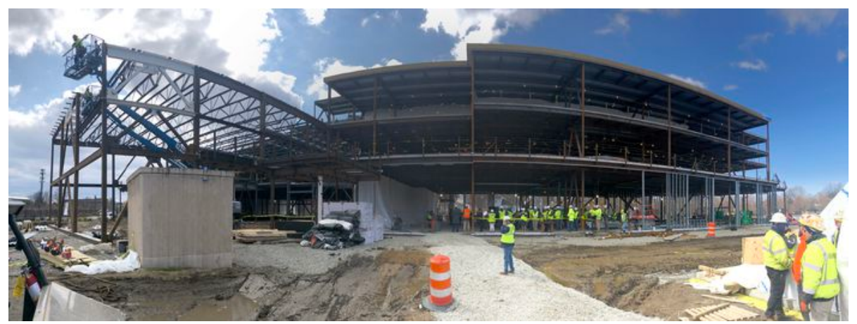
Brightwood-Lincoln Elementary Schools, under construction 2020