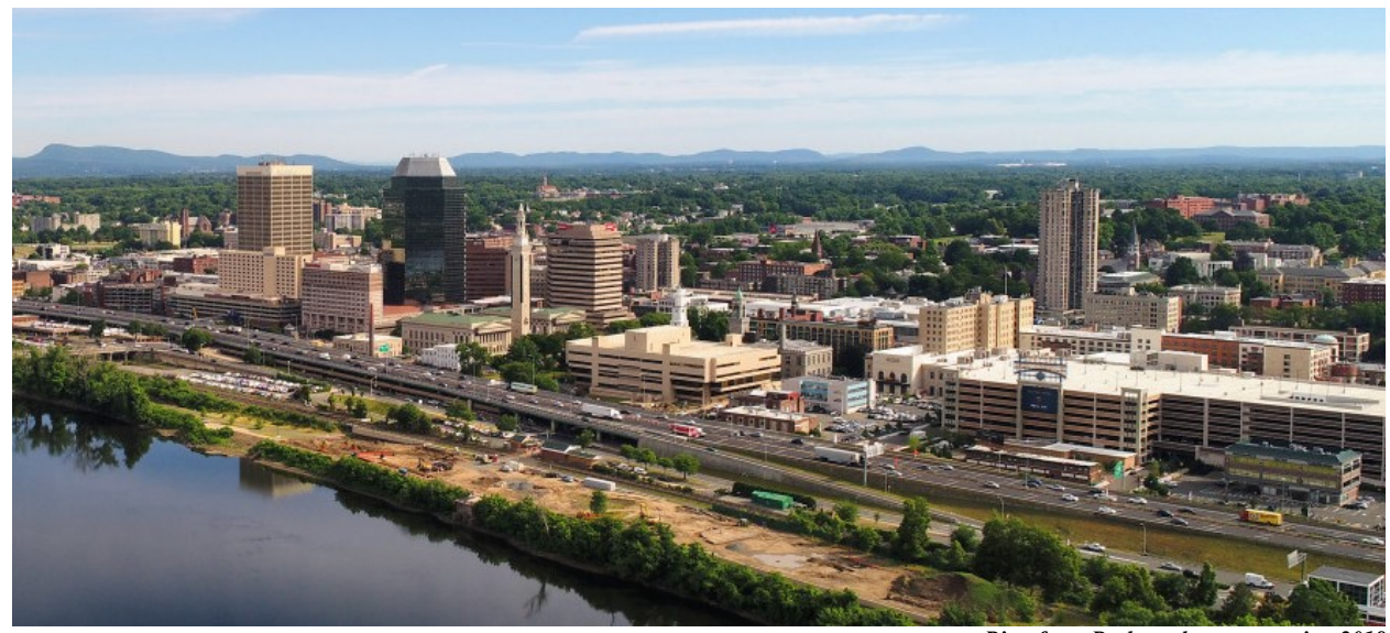
Riverfront Park, under construction 2018