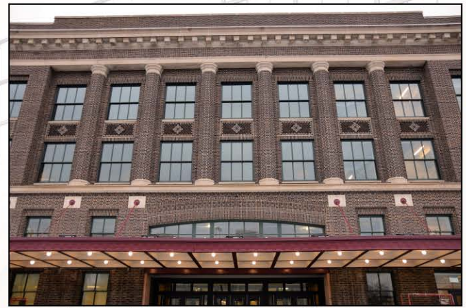
01/17 - This view of the front of the Terminal Building shows the restored canopy.