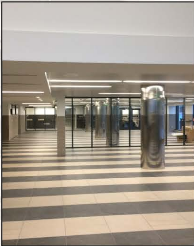
01/17 - The bus waiting area is nearly complete