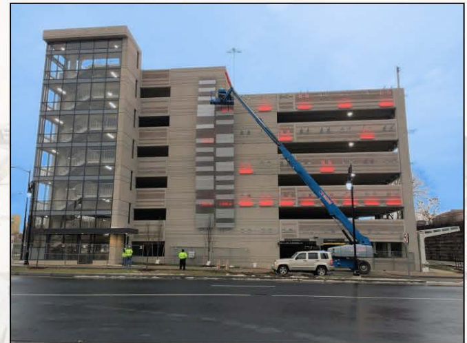
01/17 - The decorative metal panels are being installed on the Parking Garage and there is a test of the multicolored lighting.