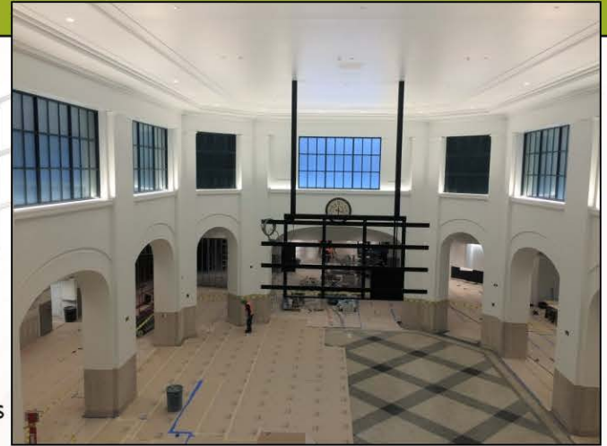
12/16 - The historic clock has been restored and installed and the Main Concourse is nearly complete