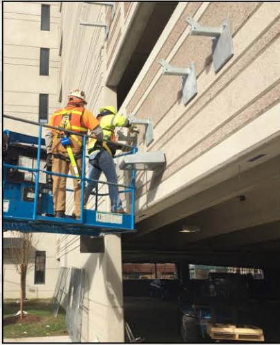
12/16 - Supports for the metal panels on the parking garage are installed