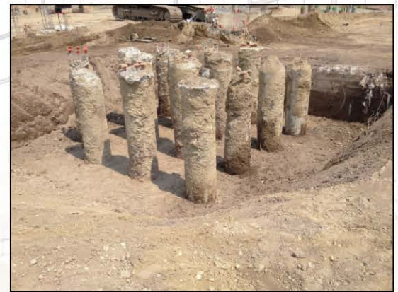
7/15 - The exposed PIFs stand like the Chinese Terracotta Warriors but these will soon be chipped down to become the warriors that will hold up the parking garage.