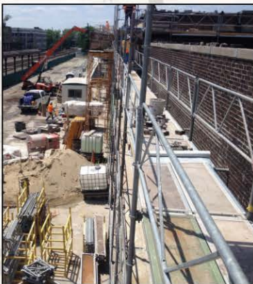
7/15 - Activity by the mason contractor behind the Terminal Building.