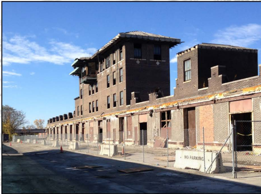
11/2014 As part of preparation for demolition, the canopy has been removed from the former baggage building. Along with other interior demolition, its attachment to the Terminal building was severed.