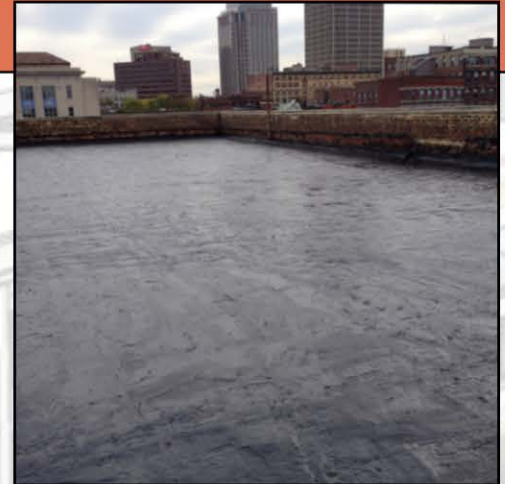
11/2014 The old asbestos laden Terminal Building roof has been removed and a liquid waterproofing applied to protect the building during the winter months.